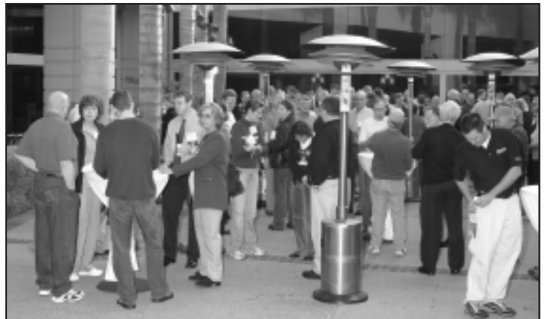
The Meet & Greet Fiesta provided a great networking opportunity.