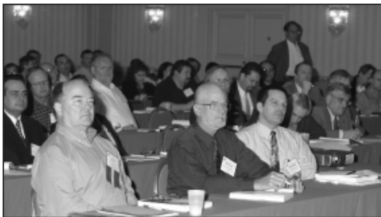
The presentations and sessions during ILSC® were well attended and covered a range of topics.