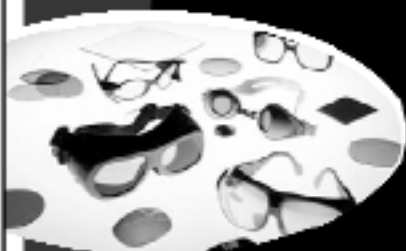
Laser Protective Eyewear

“It’s all fun and games, until someone loses an eye” - Mom