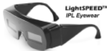
LightSPEED™ IPL Eyewear