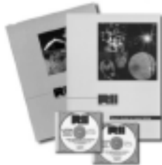
Laser Safety User Guides