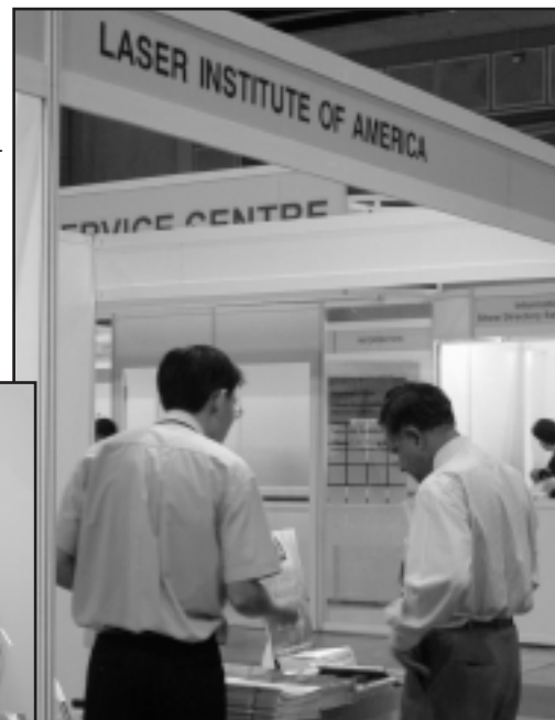
Attendees at the exhibit were shown information on LIA's benefits, goods and services.