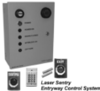
Laser Sentry Entryway Control System