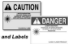
Signs and Labels