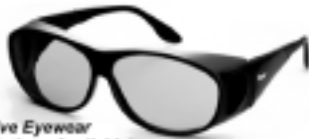
Protective Eyewear (Prescriptions Available)