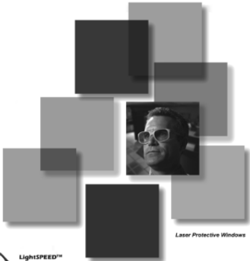
Laser Protective Windows