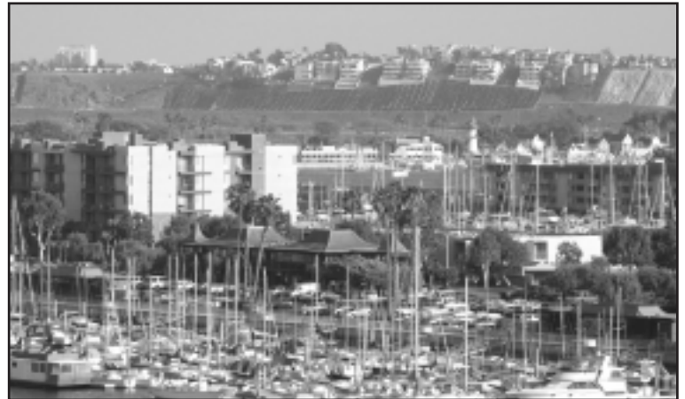
The view of the marina was outstanding.