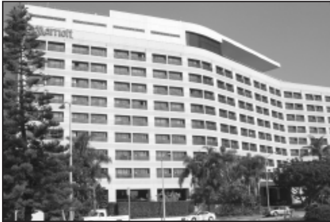
The Marina del Rey Marriott was the host hotel.